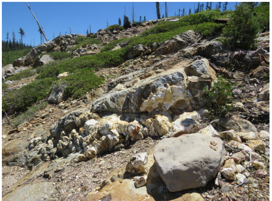
Typical quartz crystal outcropping

It is also possible to find local guides who know the sweet spots, and will give you a map or take you there themselves for a fee. These trips are generally “wilder,” and can be hit-and-miss; finding minerals is probably not guaranteed. The joy in these kinds of trips lies in exploration and enjoying a nice day in the mountains. Several members recently went on such a trip, in an area-to-remain-secret within the general gold mining belt of the Ancestral Yuba River.